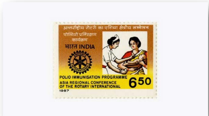
Stamp issued by India in 1987 to commemorate the Asian Regional RI Conference in New Delhi and promote polio immunization.