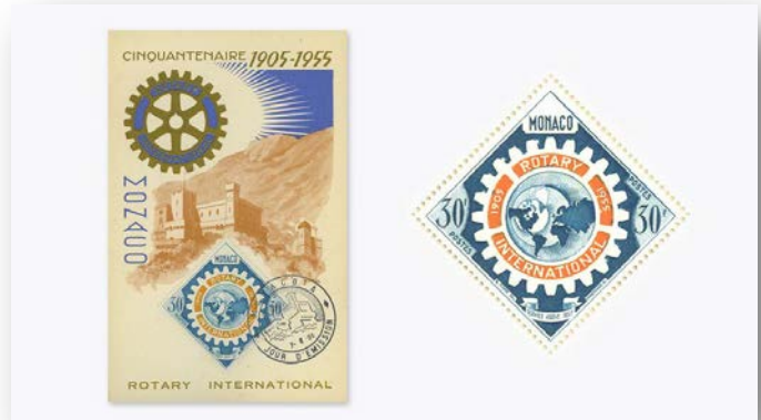
Postcard and stamp issued by Monaco in honor of Rotary's 50th anniversary. The stamp appeared in the 1963 movie Charade, starring Audrey Hepburn and Cary Grant.