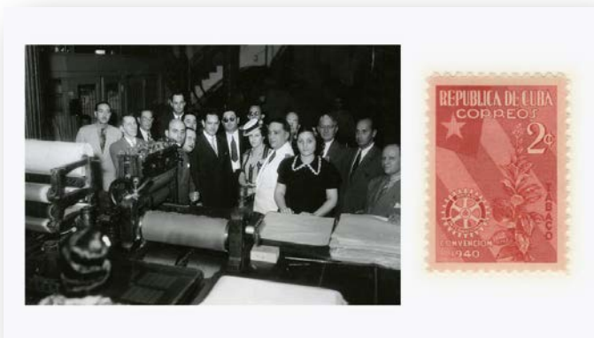
Members and guests of the Rotary Club of Havana, Cuba, at the printing of the commemorative stamp issued by Cuba for the 1940 Rotary convention in Havana.