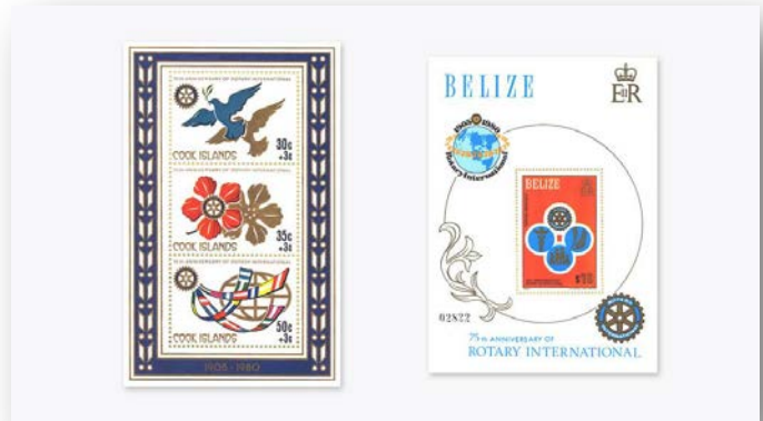
Left: Stamps issued by the Cook Islands in 1980 for Rotary's 75th anniversary. Right: Stamp issued by Belize to honor Rotary's 75th anniversary.