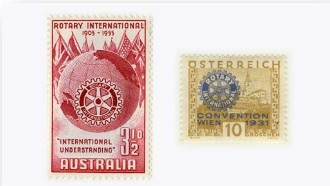
Left: Stamp issued by Australia in 1955 in honor of Rotary's 50th anniversary. Right: One of five stamps issued by Austria in 1931 in honor of the Rotary convention held there that year.